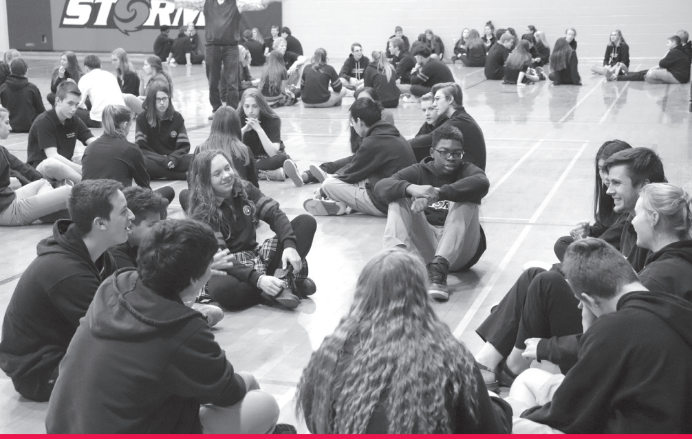
Small group discussion during Spiritual Emphasis Week